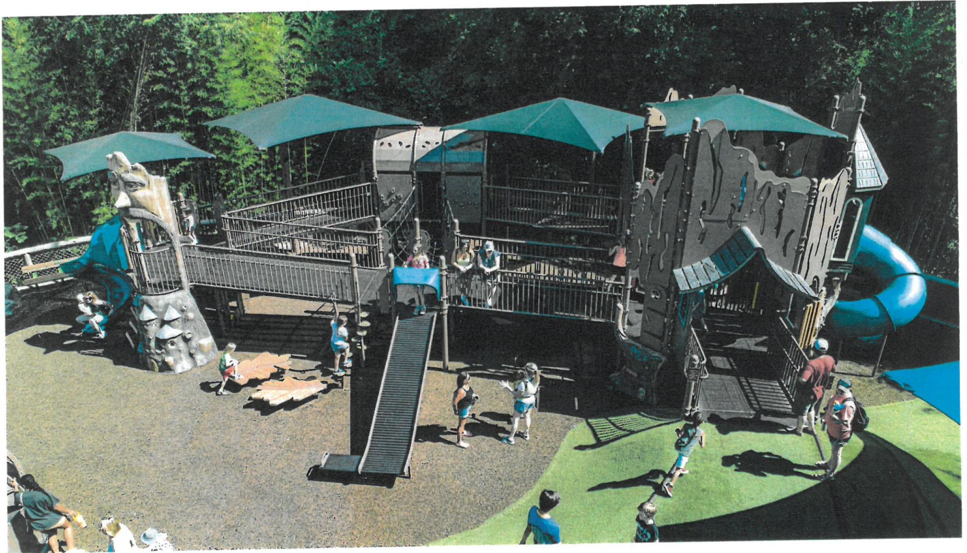
PROMISE PARK NASHVILLE ZOO