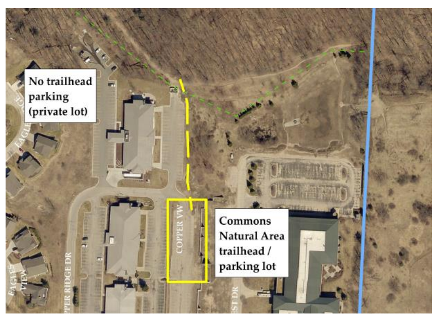
New location of temporary Copper Ridge trailhead

• Copper Ridge Trailhead – The Copper Ridge trailhead entrance was moved to a new temporary location to mitigate conflicts with traffic for the newest Copper Ridge building. Staff and Copper Ridge representatives are also discussing potential locations and designs for a permanent trailhead as envisioned in the Commons Natural Area Design Plan.