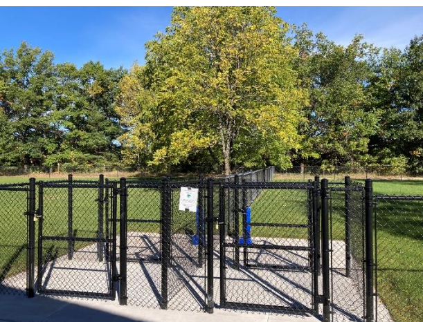
The dog park at River East Recreation Area was constructed in 2023

Bridge Repair – Staff made necessary repairs to an existing footbridge on the nature trails (seen picture to the right), as a part of regular maintenance of the park.